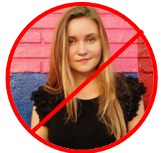
Photo Position Tips